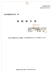
Kitasato Research Center of Environmental Sciences